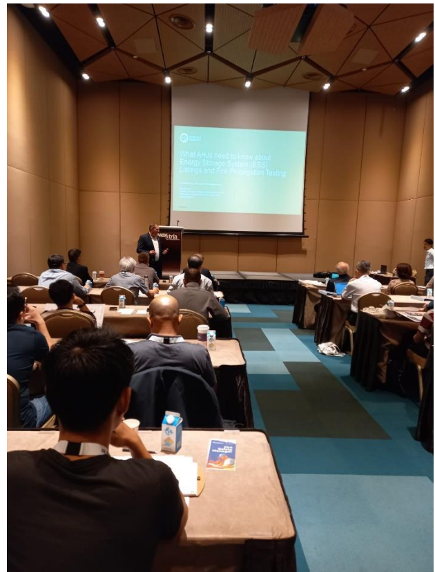
Photograph: Snapshot of the FiSAC Workshop