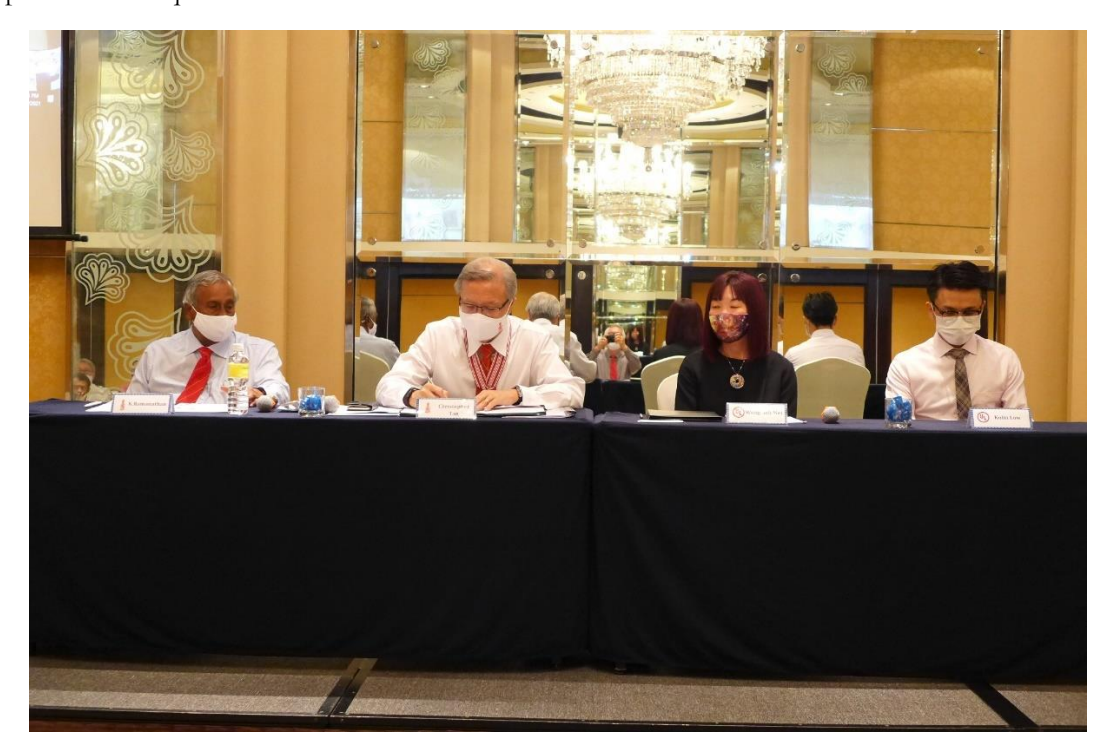
Photograph: IFE Singapore signing the MoU with UL