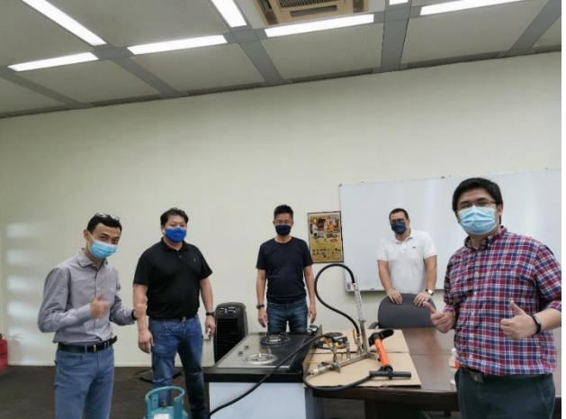
Photograph: Snapshots of the Members attending the IFE Technical Visit