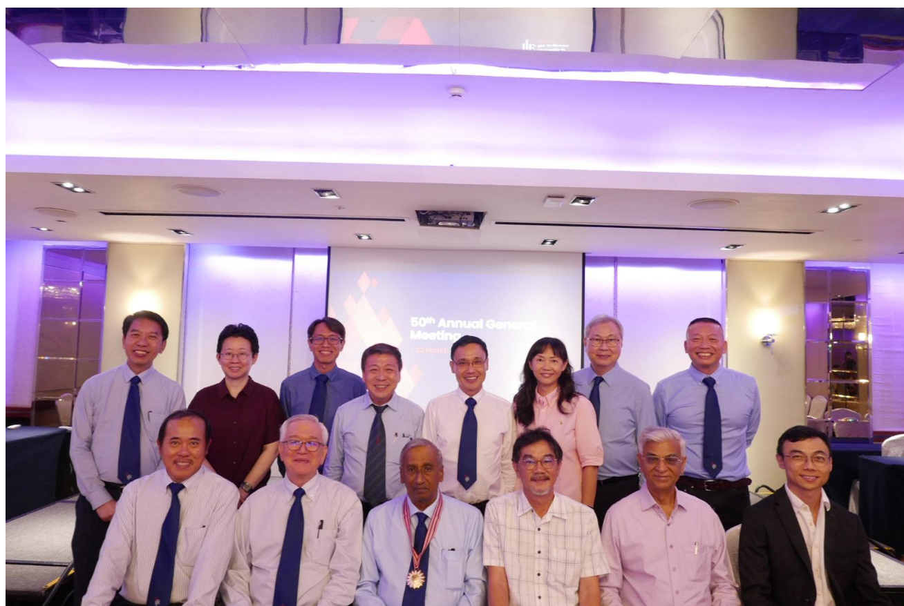
Photograph: IFES Council 2024-2026 and appointed scrutinizers for 2022-2024