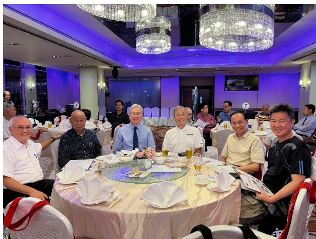
Photograph: AGM dinner