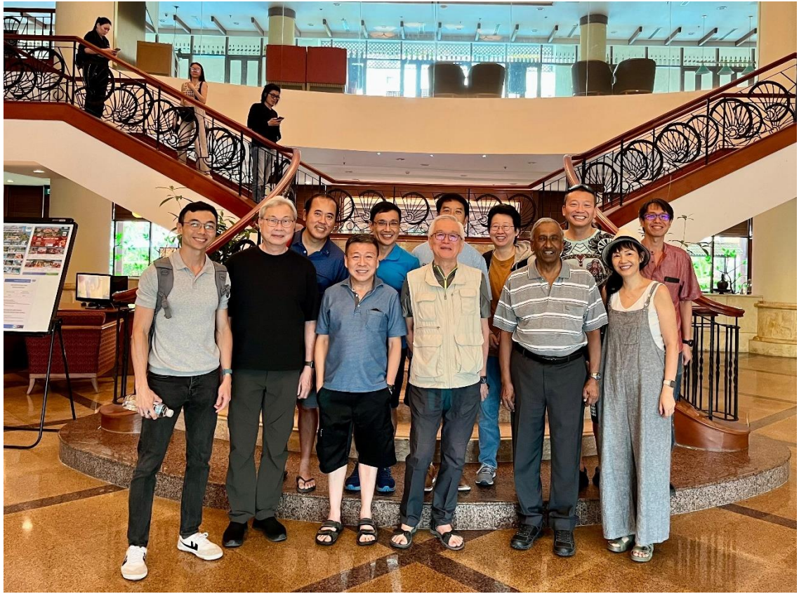
Photograph: IFES Council at Batam Retreat