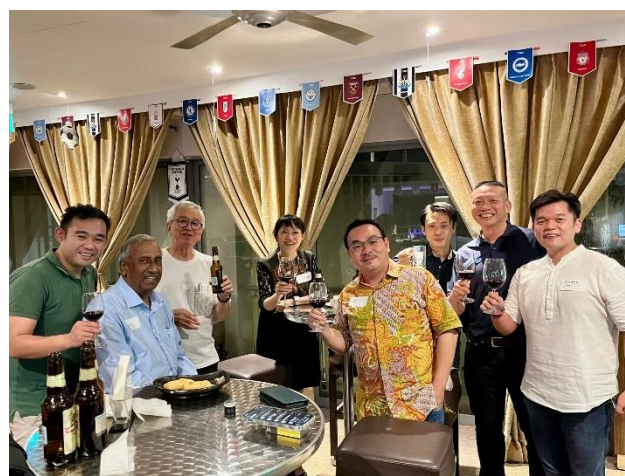
Photograph: Attendees at the Social Night