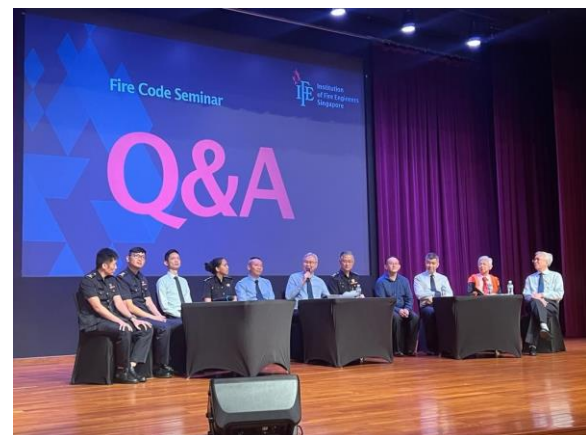
Photograph: IFES Fire Code Seminar 2023