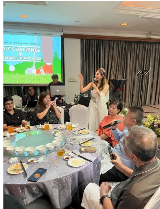
Photograph: IFES Member's Night