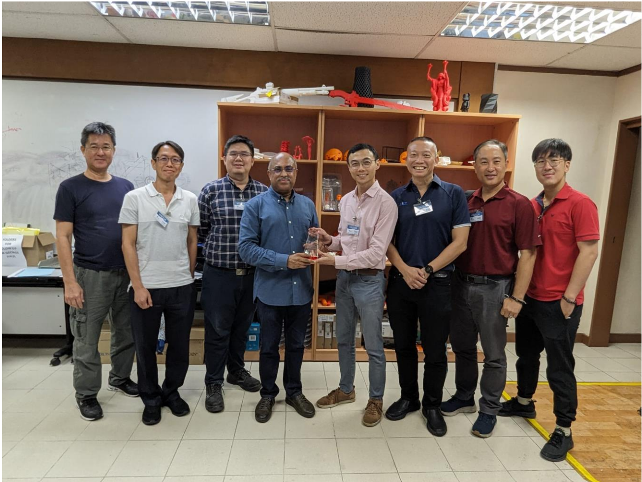
Photograph: Visit by FI-SIG to the Health Sciences Authority's (HSA) Forensic Medicine Division (FMD).