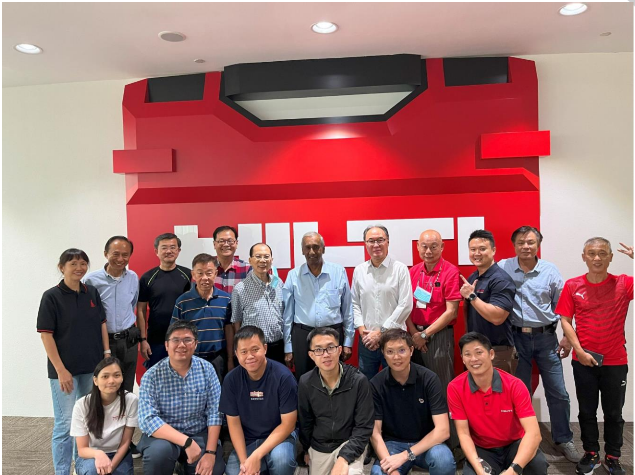
Photograph: Attendees at the Hilti Learning Centre Singapore