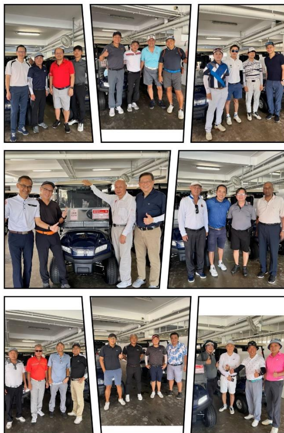
Photograph: Golfers at the half-day tournament at Orchid Country Club