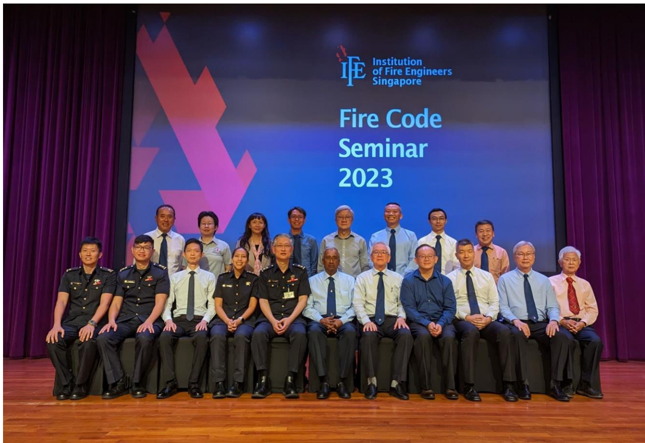
Photograph: IFES Fire Code Seminar 2023