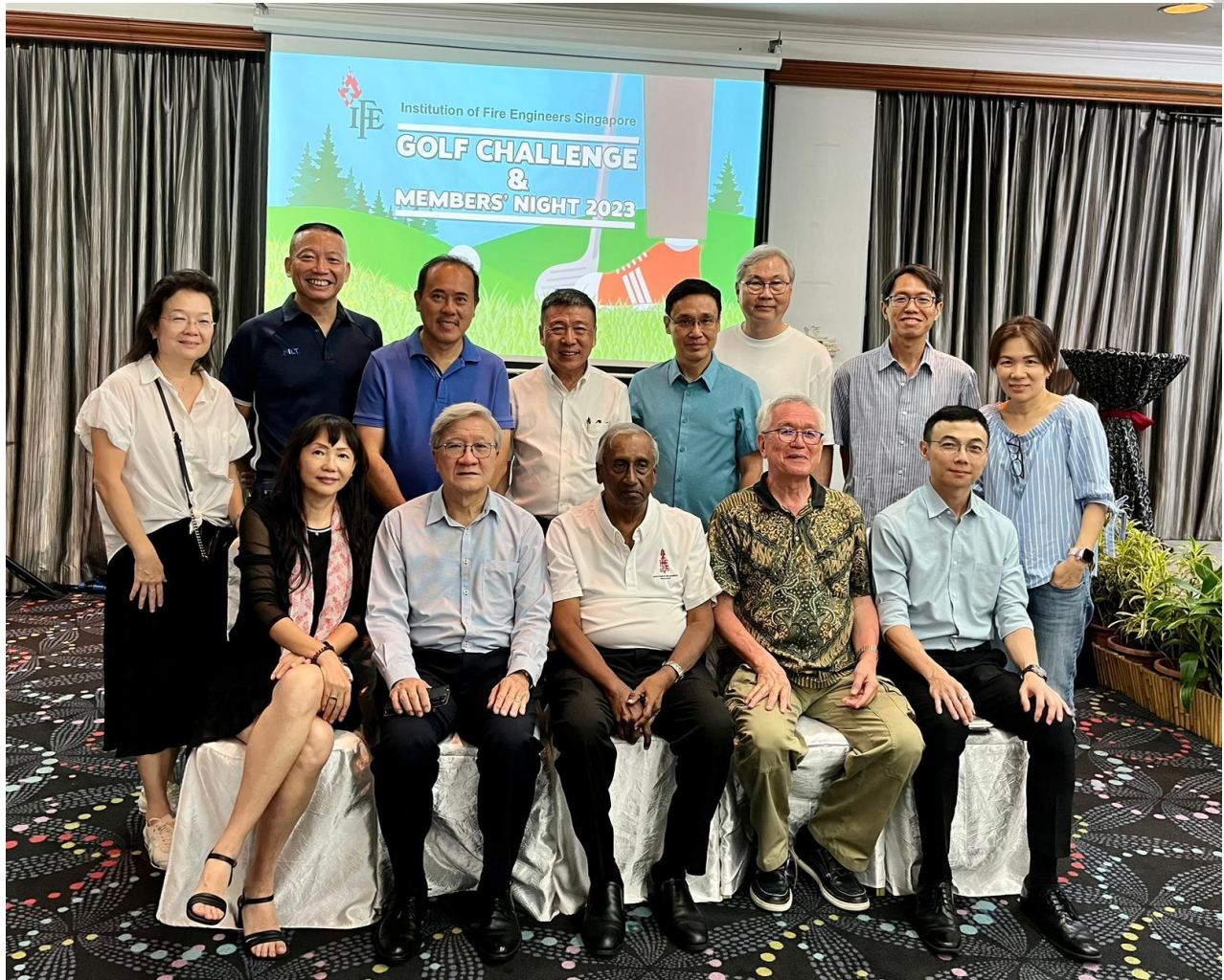
Photograph: IFES Council 2022-2024 in attendance